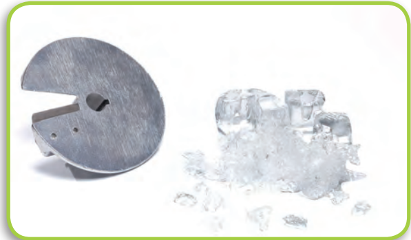
Disc adjusted in "crushed ice" position