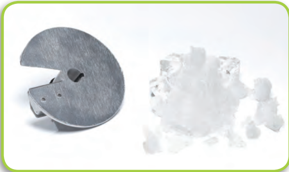
Disc adjusted in "snow ice" position

The ice crusher # 09 is delivered with one adjustable disc which can make snow ice and crushed ice.