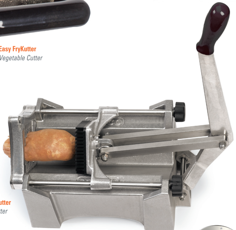
Monster FryKutter Vegetable Cutter